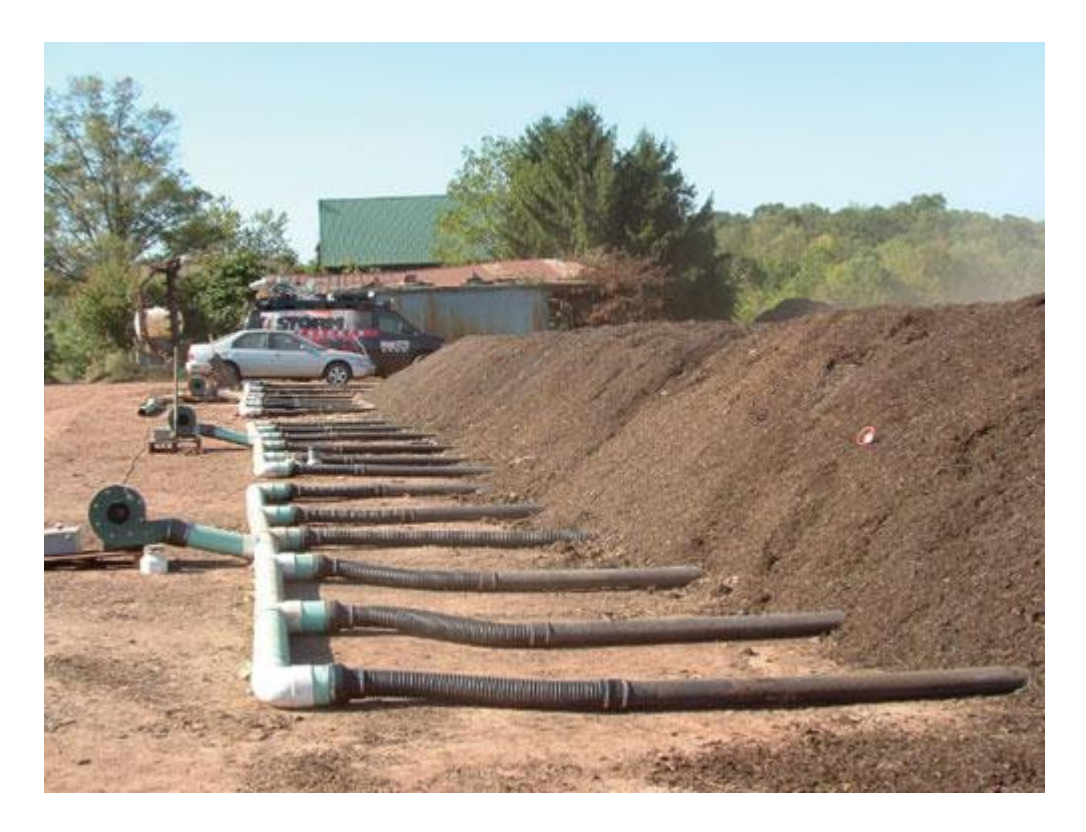
Figure 4: Example of Aerated Static Pile composting