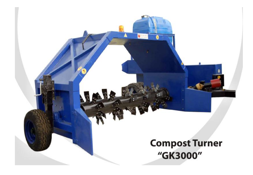
Figure 2: Compost windrow turners

turning. As the turner moves through the windrow, fresh air (oxygen) is injected into the compost by the drum/paddle assembly. The oxygen feeds the aerobic bacteria and thus speeds the composting process. In the figure 2 an example of a GK3000 compost turner is illustrated.