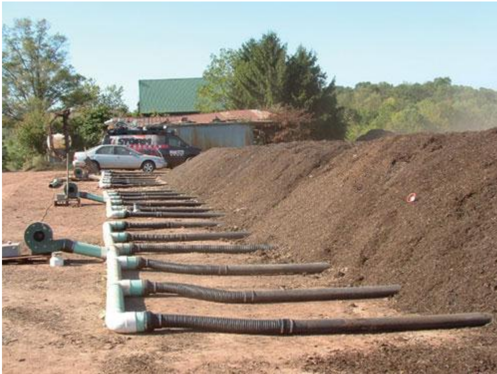
Figure 4: Example of Aerated Static Pile composting