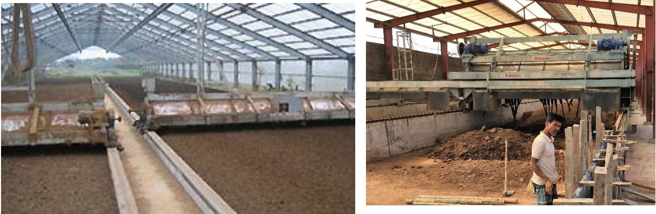
Figure 4: Compost machine for turning compost

Instead of a compost turner other machines exist which are stationary and move from the output side towards the input side, the shaft rotates and feeds the materials forward to the output side with encouraging the composting by the aeration from agitating. In conjunction with the bacteria decomposition, the temperature of the material goes up to 60-70°C. An example from Bangladesh is shown in Figure 4.