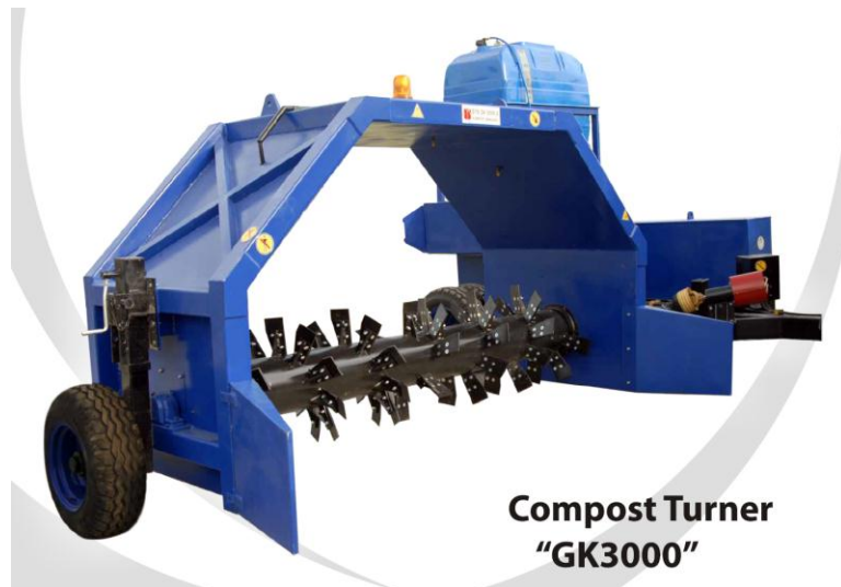
Figure 2: Compost windrow turners

turning. As the turner moves through the windrow, fresh air (oxygen) is injected into the compost by the drum/paddle assembly. The oxygen feeds the aerobic bacteria and thus speeds the composting process. In the figure 2 an example of a GK3000 compost turner is illustrated.